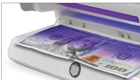
Verifies UV features of bills - suitable for all currencies