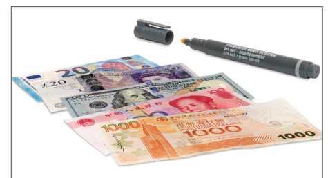
Suitable for all currencies