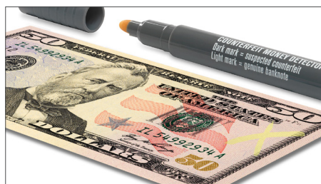
Light mark: Genuine bill