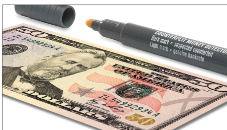
Dark mark: Suspected counterfeit bill