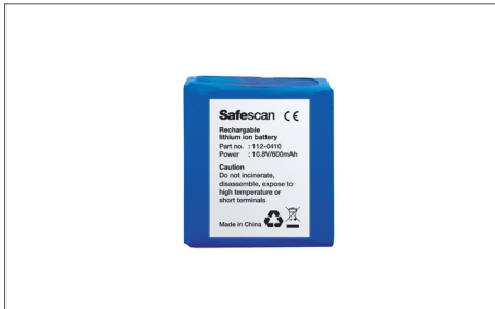
Safescan LB-105 Rechargeable battery Art. no: 112-0410