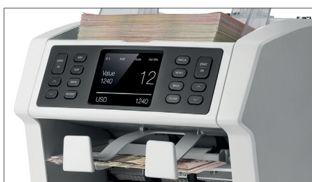
Value-mix: Counts bills in stacks of a preset value