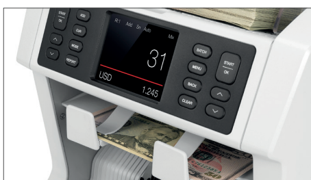
Suspected counterfeit bills are placed in the reject pocket