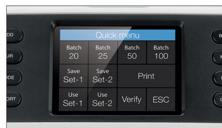
Large color touch screen with quick menu and numeric keyboard