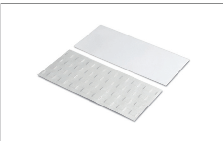
Safescan Cleaning cards Art. no: 136-0546