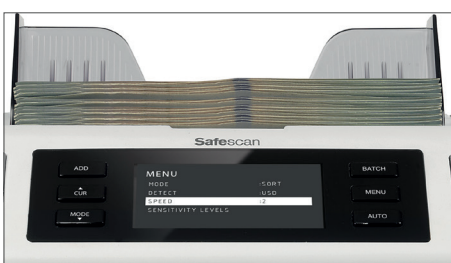
Adjustable counting speed - 800, 1,200 or 1,500 bills per minute