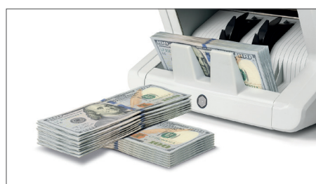
Batch function, to create fixed series of a preset number of bills