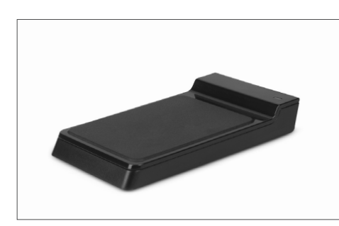
TimeMoto RF-150 USB RFID Reader Art. no: 125-0605