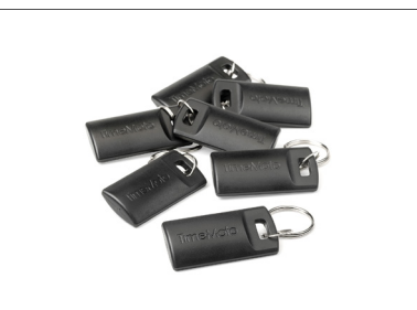
TimeMoto RF-110 set of 25 RFID key fobs Art.no: 125-0604