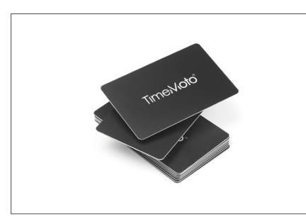
TimeMoto RF-100 set of 25 RFID badges Art. no: 125-0603