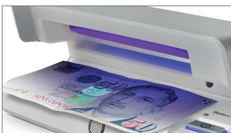
Verifies UV features of banknotes - suitable for all currencies