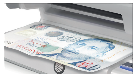
Large LED white light area to verify watermarks, metallic thread and microprint