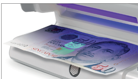
Verifies UV features of banknotes - suitable for all currencies