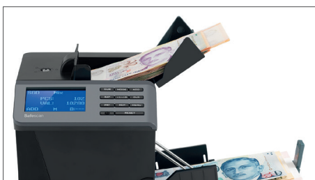
Value counting for unsorted SGD, MYR, HKD, CNY, TWD, JPY, AUD, KRW, USD, EUR and GBP banknotes