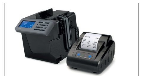
Compatible with Safescan TP-230 thermal printer