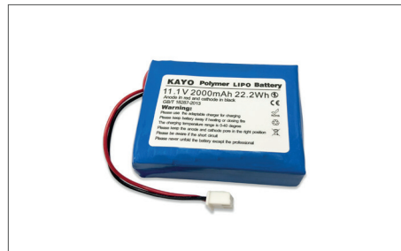
Safescan LB-115 Rechargeable battery Art. no: 112-095