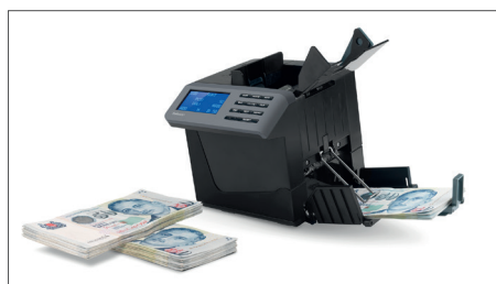
Batch function: Create fixed series of a pre-set number of banknotes