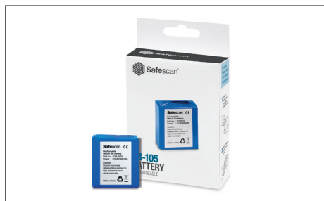
Safescan LB-105 Rechargeable battery Art. no: 112-0410