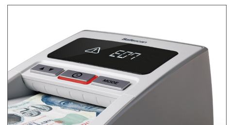
Suspected banknote alarm with visual and audio alert