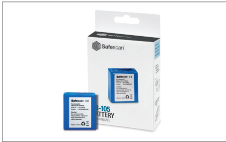
Safescan LB-105 Rechargeable battery Art. no: 112-0410