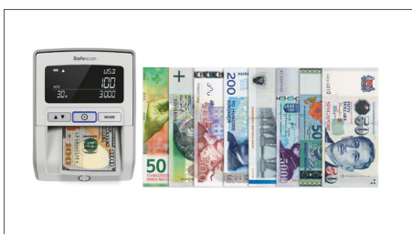
Verifies up to 9 currencies