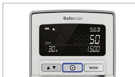
Shows value and total amount of the scanned banknotes