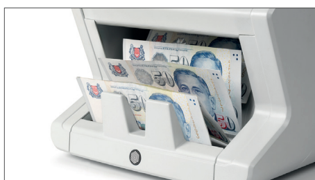
Counts sorted notes for all currencies