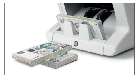
Batch function, to create fixed series of a pre-set number of banknotes