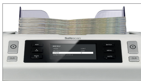
Adjustable counting speed: 800, 1.200 or 1.500 banknotes per minute