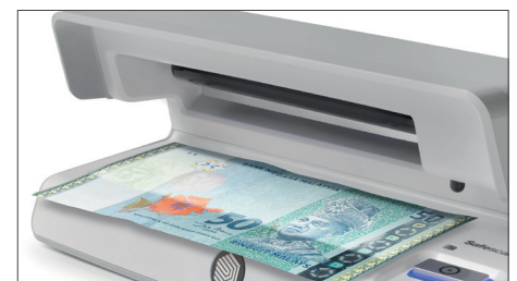
Large LED white light area to verify watermarks, metallic thread and microprint