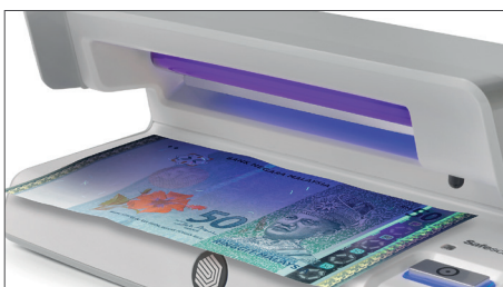
Verifies UV features of banknotes - suitable for all currencies