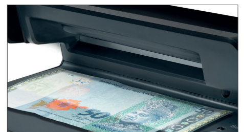
Large white light area to verify watermark, metallic thread and microprint