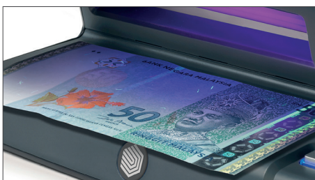
Verifies UV features of banknotes - suitable for all currencies