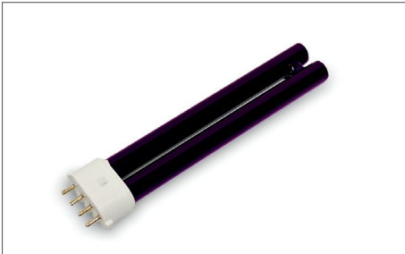
Safescan 50 / 70 UV tube