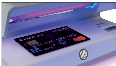
Verifies UV features of credit cards