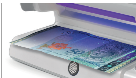
Verifies UV features of banknotes - suitable for all currencies