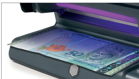
Verifies UV features of banknotes - suitable for all currencies