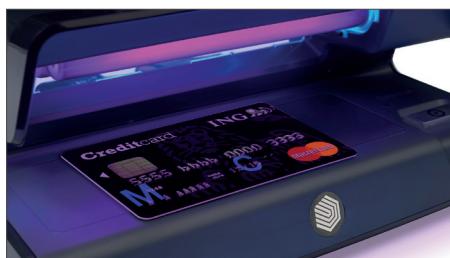
Verifies UV features of credit cards