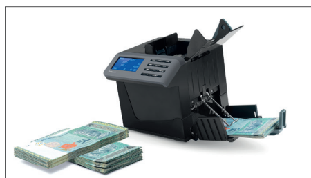
Batch function: Create fixed series of a pre-set number of banknotes