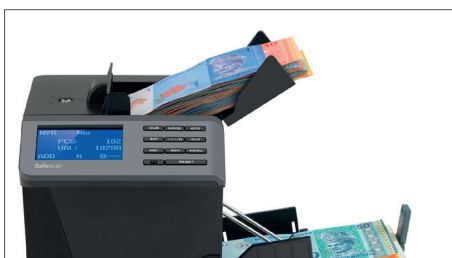
Value counting for unsorted MYR, HKD, CNY, SGD, TWD, JPY, AUD, KRW, USD, EUR and GBP banknotes