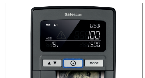
Shows quantity and value of the scanned bills