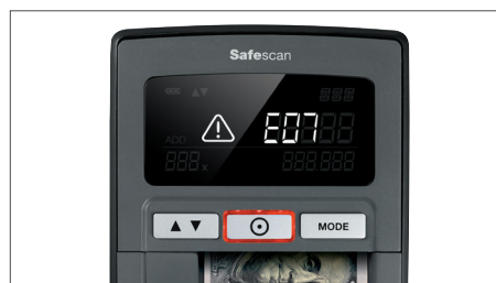
Visible and audible counterfeit banknote alarm