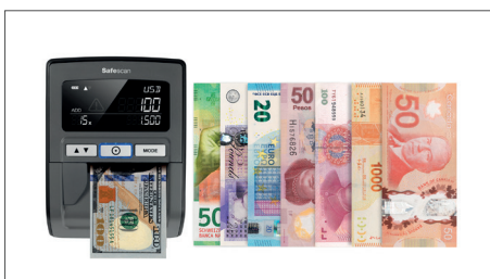
Verifies 8 currencies in all directions