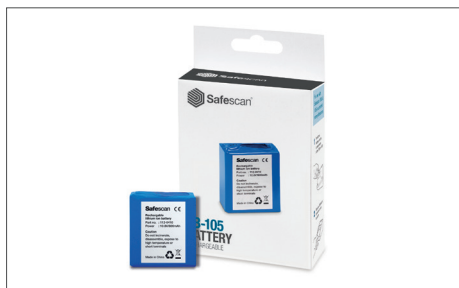
Safescan LB-105 Rechargeable battery Art. no: 112-0410