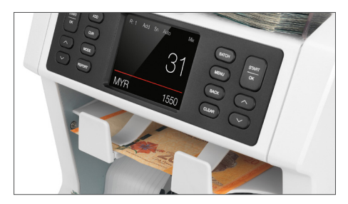
Suspected counterfeit banknotes are placed in the reject pocket