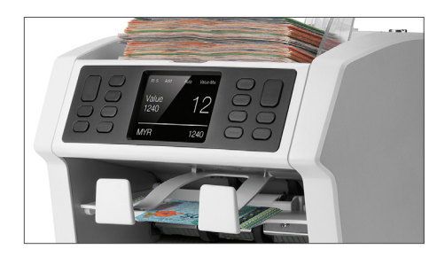
Value-mix: Counts banknotes in stacks of a preset value