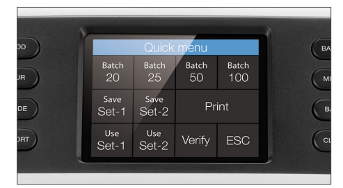
Large touch screen with quick menu and numeric keyboard