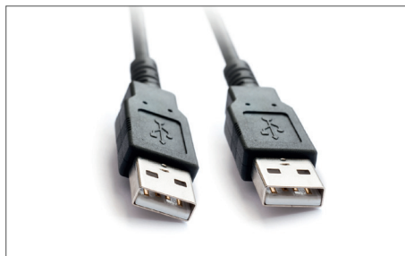
Safescan USB Cable Art. no: 124-0458