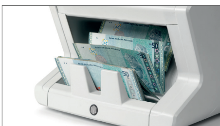
Counts sorted notes for all currencies