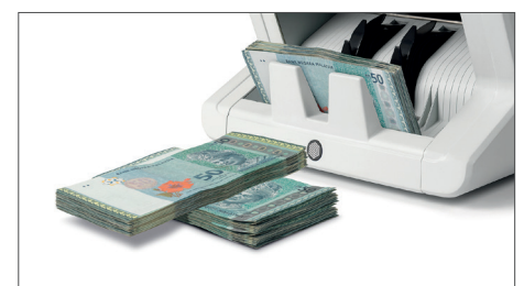
Batch function, to create fixed series of a pre-set number of banknotes