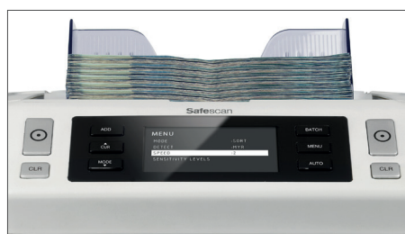
Adjustable counting speed: 800, 1.200 or 1.500 banknotes per minute