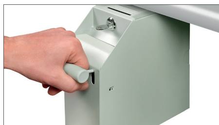
Easy mounting out of sight under the cash desk