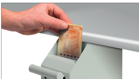
Insert banknotes for secure storage