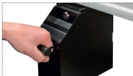
Easy mounting out of sight under the cash desk