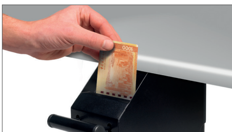
Insert banknotes for secure storage