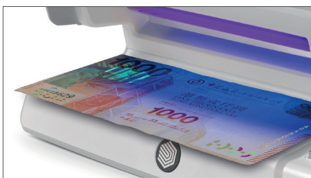
Verifies UV features of banknotes - suitable for all currencies