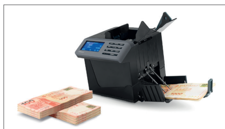
Batch function: Create fixed series of a pre-set number of banknotes