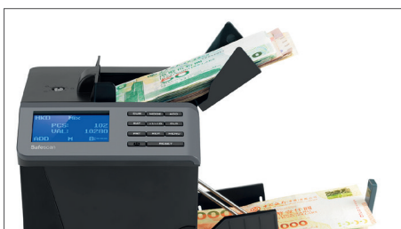
Value counting for unsorted HKD, CNY, SGD, MYR, TWD, JPY, AUD, KRW, USD, EUR and GBP banknotes