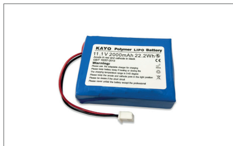
Safescan LB-115 Rechargeable battery Art. no: 112-095