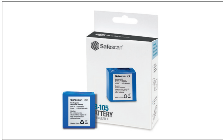
Safescan LB-105 Rechargeable battery Art. no: 112-0410