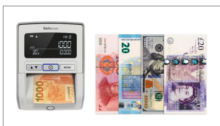
Verifies up to 9 currencies