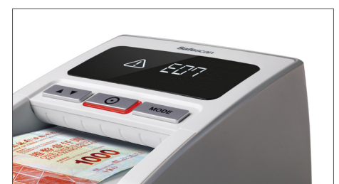
Suspected banknote alarm with visual and audio alert