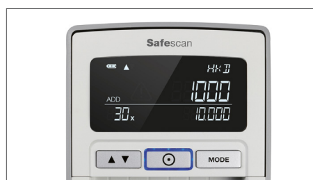
Shows value and total amount of the scanned banknotes