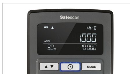
Shows value and total amount of the scanned banknotes