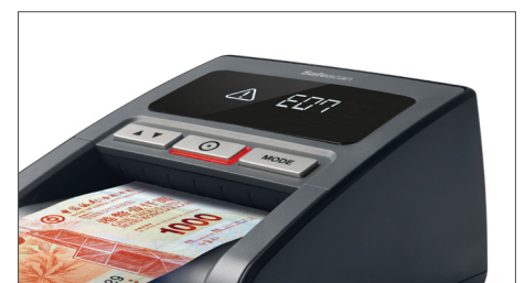
Suspected banknote alarm with visual and audio alert