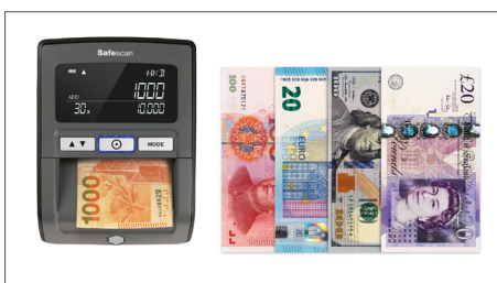
Verifies up to 9 currencies