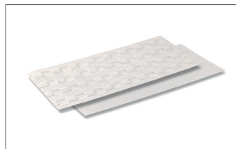
Safescan Cleaning cards Art. no: 136-0546