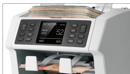
Value-mix: Counts banknotes in stacks of a preset value