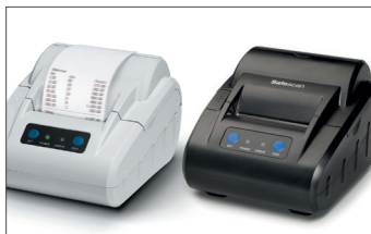
Safescan TP-230 Thermal printer Art. no: 134-0475 grey Art. no: 134-0535 black