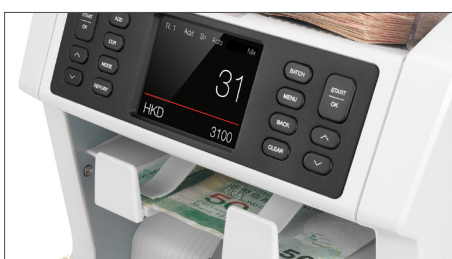
Suspected counterfeit banknotes are placed in the reject pocket