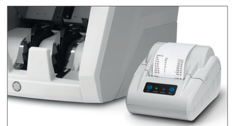
Print the count results instantly on the Safescan TP-230 printer