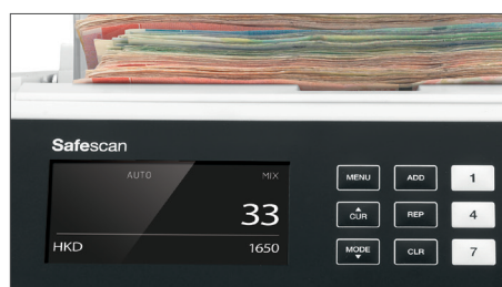
Counts unsorted banknotes for: HKD, USD, EUR, GBP, CAD, MXN, CNY, SGD, MYR, JPY