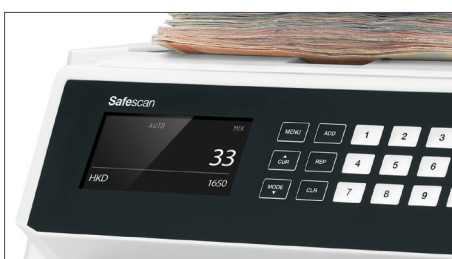
Automatic currency and denomination recognition