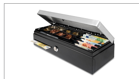
Robust and secure metal housing