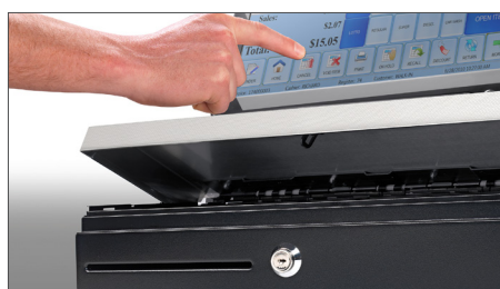
Easy to combine with existing cash registers and POS environments