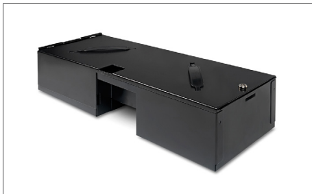
Safescan 4617CL Lockable lid Art. no: 121-0571