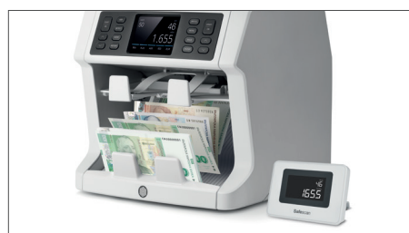
Share counting results with customers in real-time