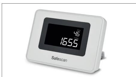
External LCD display for Safescan banknote counters

Please note that the Safescan ED-160 is only compatible with the Safescan 2985-SX models with the following product codes: 112-0649, 112-0650