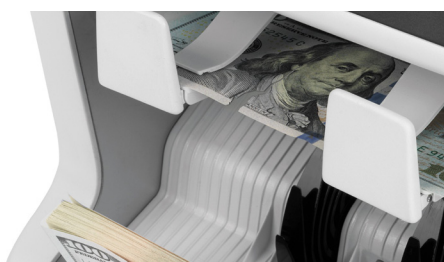
Identifies bills that are unsuitable for ATM machines and circulation