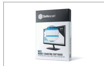
Safescan MCS Software Art. no: 124-0500