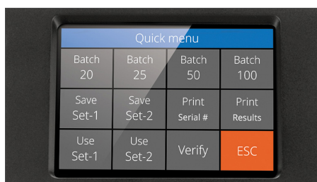
High definition touch screen with multi-lingual quick menus