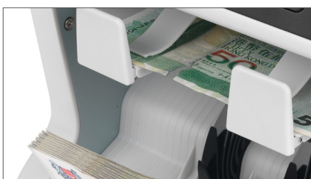
Identifies banknotes that are unfit for ATM machines and recirculation