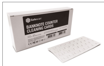
Safescan Cleaning Cards Art. no: 152-0663