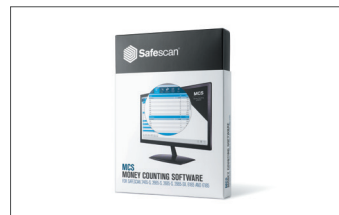
Safescan MCS Software Art. no: 124-0500