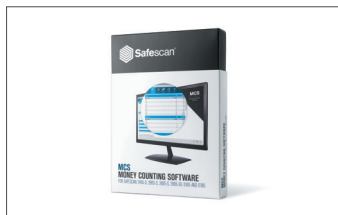
Safescan MCS Software Art. no: 124-0500