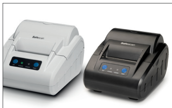
Safescan TP-230 Thermal Printer Art. no: 134-0475 Grey Art. no: 134-0535 Black