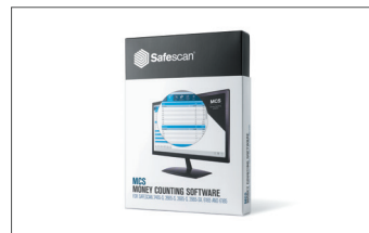
Safescan MCS Software Art. no: 124-0500