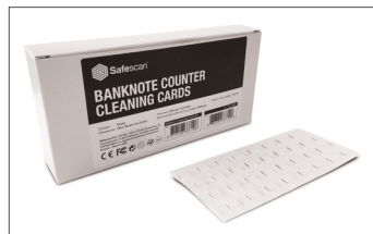
Safescan Cleaning Cards Art. no: 152-0663