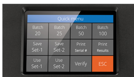
High definition touch display with multi-lingual interface and quick menu