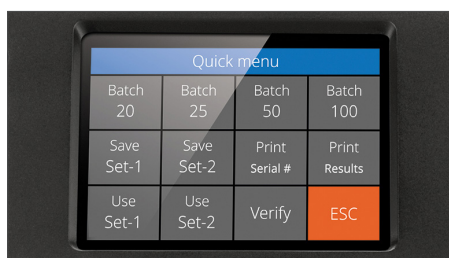
High definition touch display with multi-lingual interface and quick menu