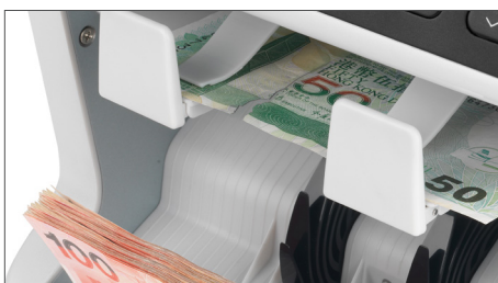
Identifies banknotes that are unfit for ATM machines and recirculation