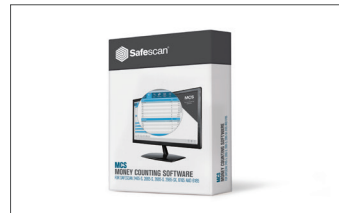
Safescan MCS Software Art. no: 124-0500