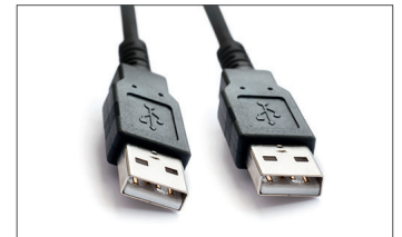
Safescan USB Cable Art. no: 124-0458