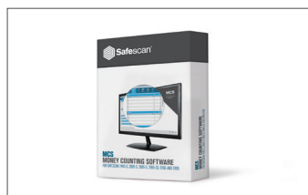
Safescan MCS Software Art. no: 124-0500