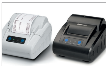
Safescan TP-230 Thermal printer Art. no: 134-0475 grey Art. no: 134-0535 black