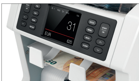
Suspected counterfeit banknotes are placed in the reject pocket