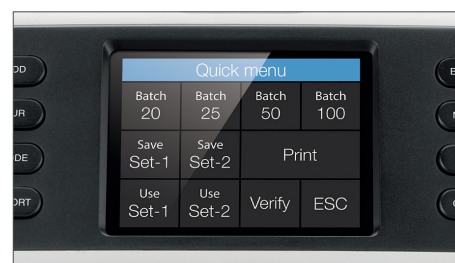
Large touch screen with quick menu and numeric keyboard