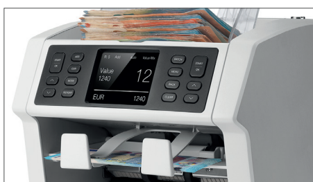
Value-mix: Counts banknotes in stacks of a preset value