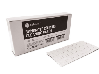
Safescan Cleaning Cards Art. no: 152-0663