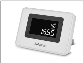
Safescan ED-160 Art. no: 112-0665