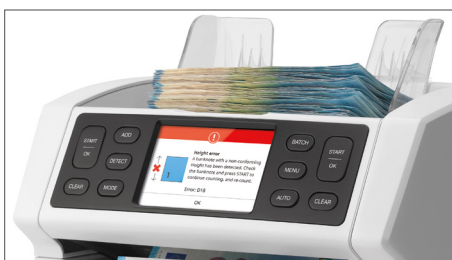
Displays a detailed message when a suspected banknote is detected