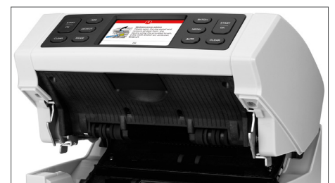
Internal parts and sensors can easily be cleaned by opening the top panel