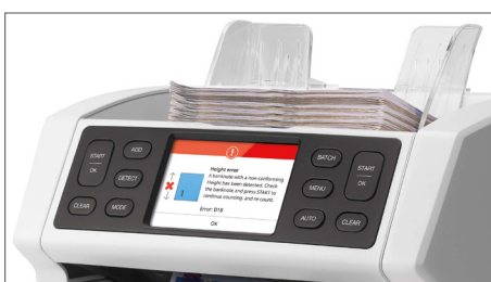
Displays a detailed message when a suspected banknote is detected