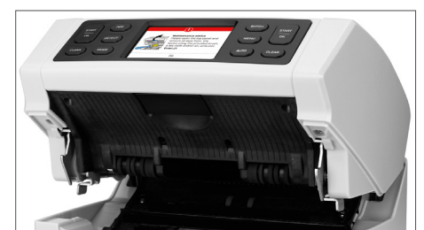
Internal parts and sensors can easily be cleaned by opening the top panel