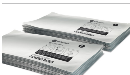
2 different types of cleaning cards for optimal cleaning result