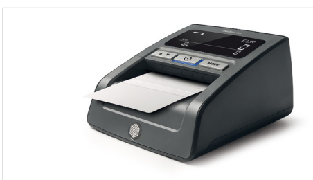
Cleaning cards for automatic counterfeit detectors