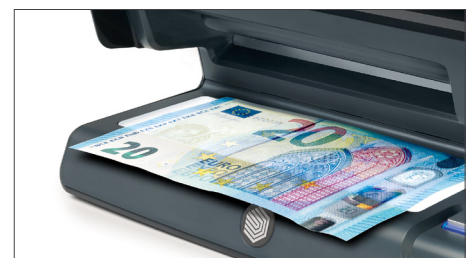
Large white light area to verify watermark, metallic thread and microprint