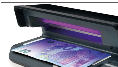
Verifies UV features of banknotes - suitable for all currencies