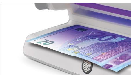
Verifies UV features of banknotes - suitable for all currencies