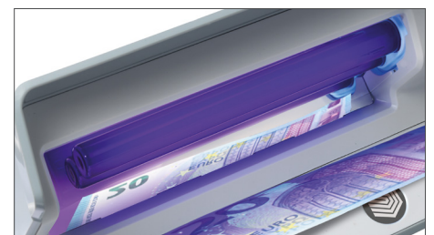
Unique reflector for enhanced UV light quality