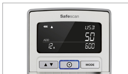
Shows value and total amount of the scanned banknotes