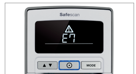
Suspected banknote alarm with visual and audio alert