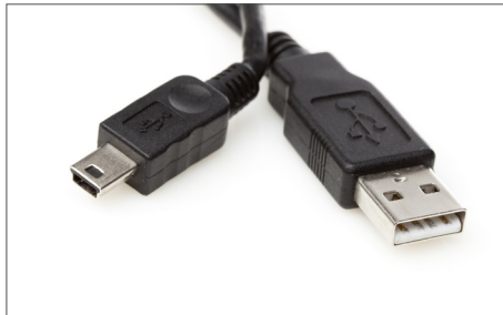
Safescan USB update cable Art. no: 112-0459