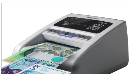
Verifies up to 9 currencies