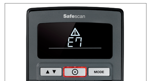
Suspected banknote alarm with visual and audio alert