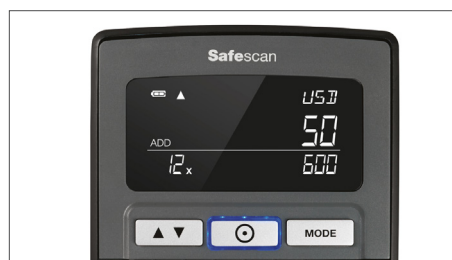
Shows quantity and totals