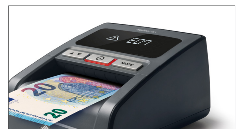
Counterfeit banknote alarm