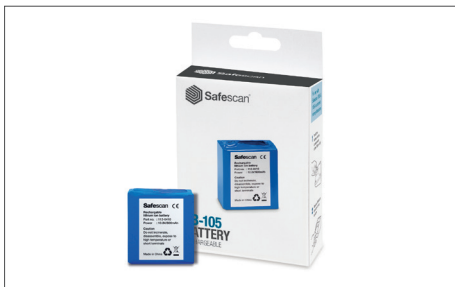
Safescan LB-105 Rechargeable battery Art. no: 112-0410