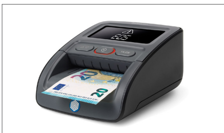
Checks and verifies banknotes on up to seven security features