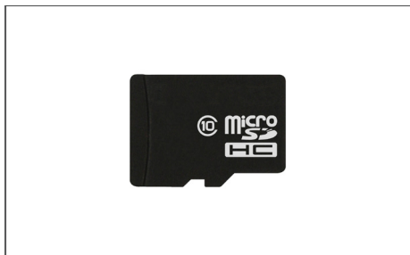
Safescan MicroSD Card Art. no: Various (based on device and currencies)