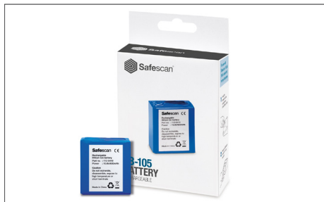
Safescan LB-105 Rechargeable battery Art. no: 112-0410