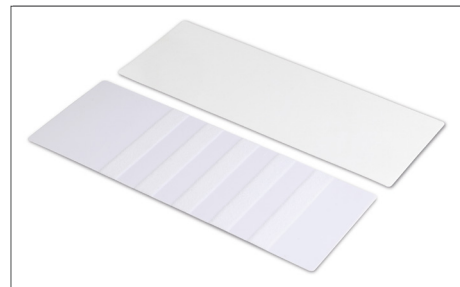
Safescan Cleaning cards Art. no: 136-0545