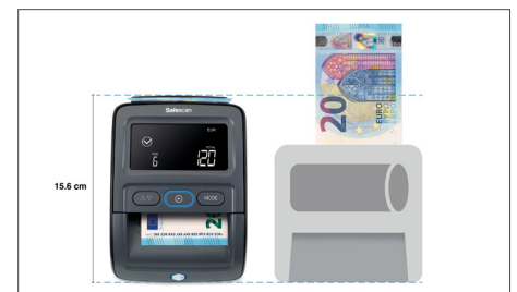
Has one of the smallest operational footprints available compared to other solutions on the market