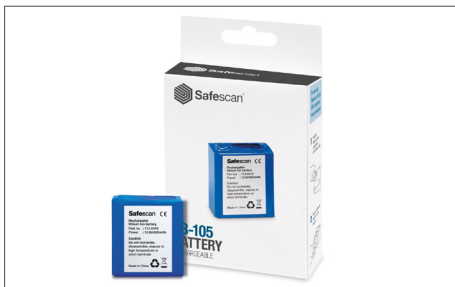
Safescan LB-105 Rechargeable battery Art. no: 112-0410