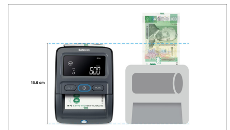
Has one of the smallest operational footprints available compared to other solutions on the market