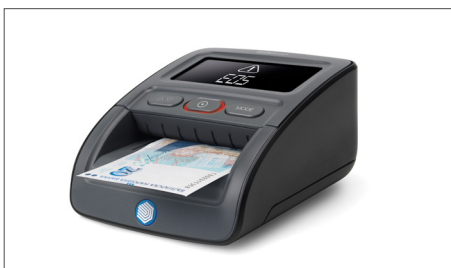
Checks and verifies banknotes on up to seven security features