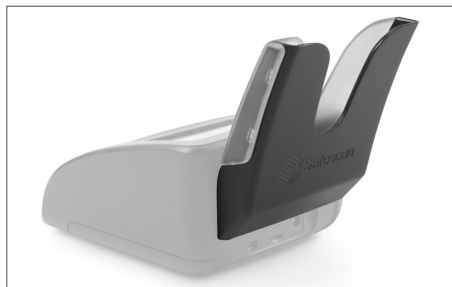
Safescan RS-100 Banknote Stacker Art. no: 112-0695