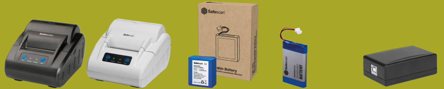
Safescan TP-230 Thermal Receipt Printer Safescan TP-230 Thermal Receipt Printer Safescan LB-105 Rechargeable Battery Safescan LB-205 Rechargeable Battery Safescan UC-100 USB Cash Drawer Trigger

For all Safescan accessories visit www.safescan.com