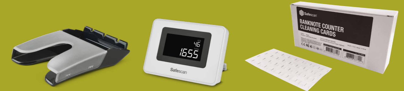
Safescan RS-100 Removable Stacker Safescan ED-160 External LCD Display Safescan Cleaning Cards For Banknote Counters